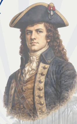
John Paulding AMERICAN REVOLUTION HERO