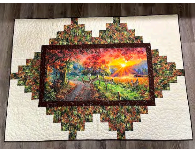
Pictured is the beautiful quilted wall hanging that will be raffled during the 2026 Quilt Show at the Paulding County History Museum. The piece was generously donated by Red Barn Quiltery of Monroeville, Indiana, with raffle proceeds helping support museum programming and events during Quilt Show week.

The Paulding County History Museum is excited to announce its 2026 Quilt Show, continuing a cherished local tradition celebrating the artistry, craftsmanship, and history of quilting in Paulding County. Now in its second year at