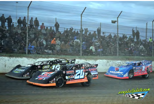
No. 20 Ricky Thornton Jr wins at Atomic