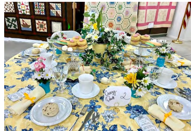
From the 2025 Spring Tea. Make plans now to attend this annual event on April 25 at the Paulding County History Museum. Nine tables will be decorated especially for this event.

PAULDING - It's time to make plans to attend Paulding County History Museum's annual Spring Tea.