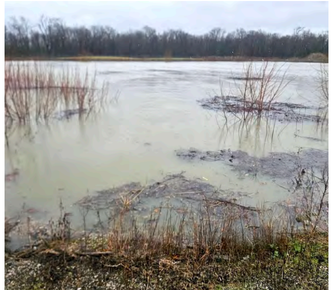
Flooding near Payne, OH. Flooding continues to be an issue in the area with the Maumee River cresting at 13.9 feet on Friday, April 3 rd . (flood stage is 11 feet)

Maybe I have a list phobia because if I need or have to do or go someplace, I need a list.