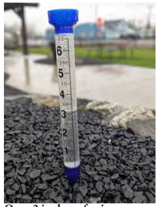
Over 3 inches of rain were report across the region

This year's first event, the Spring Tea, will be held Saturday, April 25 from 1:00-3:00 p.m.