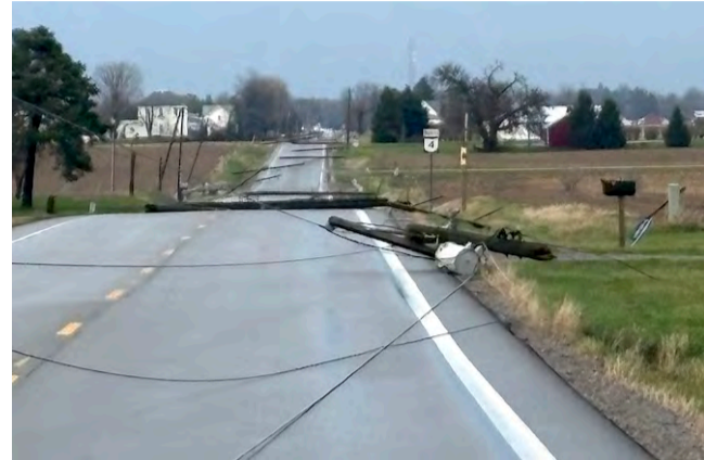
Powerlines fell victim to the March 31st storms as these did near Van Wert, OH.

Severe storms moved through northeast Indiana and northwest Ohio from the evening of March 31 into the early morning hours of April 1, bringing heavy rain, damaging winds, and at least one confirmed tornado to the region.