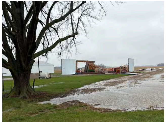
Structural damage due to the EF-1 tornado that was confirmed just outside of Hicksville, OH on March 31 st , 2026.