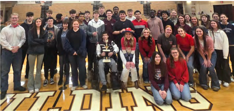
Pictured here are the Junior Class who were the winners of the Annual FFA Country Olympics during National FFA Week.