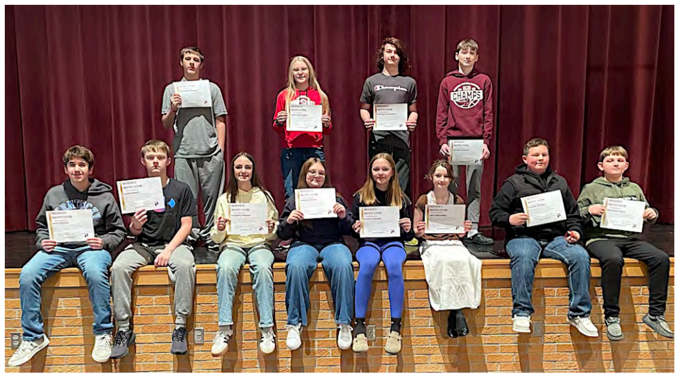
Paulding Junior High School is utilizing the 7-Mindsets curriculum to address the social and emotional needs of students. Each unit revolves around a specific theme students can apply to their lives. This unit's theme was We Are Connected. Shown in the picture are Paulding Junior High School's We Are Connected Mindset Motivators.