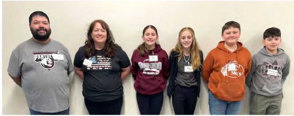
On Saturday, February 28th students and staff from Paulding Junior High School volunteered at the Caring and Sharing Food Pantry in