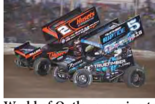
World of Outlaws coming to Fremont Speedway May 27th.