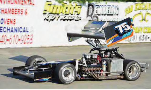
Super Modifieds coming back to Sandusky Speedway.