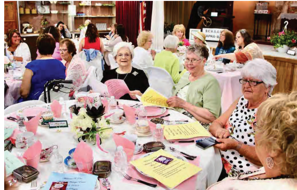
The John Paulding Historical Museum will host its popular Spring Tea on May 11.

Plans are in place for JPHS' annual Spring tea.