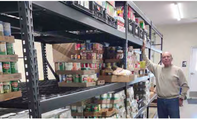
Dan Bulau, pantry board president, showing off new pantry storeroom shelves.

At 318 N. Walnut Street in Paulding, the new building of the Caring & Sharing Food Pantry is nearly ready for business. Shelving (some purchased and some donated) is being assembled in the new market and stockroom. Here's the schedule of events for the next two weeks: