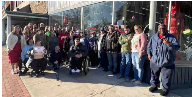
Limitless by PC Workshop crew.