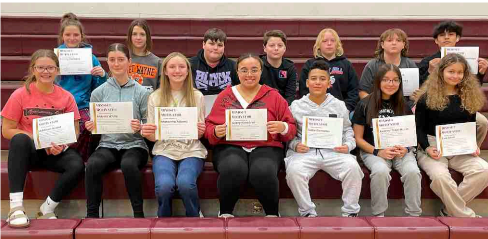
Paulding Junior High School uses a social-emotional curriculum called The 7-Mindsets to help students explore positive character traits. After each mindset unit is completed teachers at PJHS select Mindset Motivators who have actively participated in the lessons. Shown in the picture are the PJHS Mindset Motivators for the unit We Are Connected.