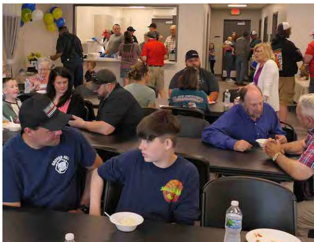
The newly renovated Grover Hill Lions Club Community Center is open for rentals and events to the public, complete with kitchenette and restrooms for guests.

"A wife of noble character who can find? She is worth far more than rubies." — Proverbs 31:10,27-28