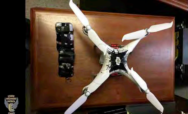
COLUMBUS - Three suspects have been indicted in the Franklin County Court of Common Pleas on a combined 116 counts of conveyance-related charges after an investigation by troopers from the

Ohio State Highway Patrol's Office of Investigative Services and investigators from the Ohio Department of Rehabilitation & Correction's Chief Inspector's Office.