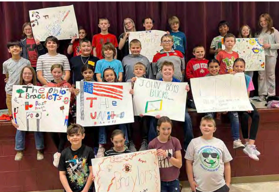
The 4th graders at Oakwood Elementary became entrepreneurs. They took out a loan to open a bracelet company. They designed, manufactured, marketed, and sold their product: bracelets. Of the 7 companies, 6 of them made a profit. Nice Job!