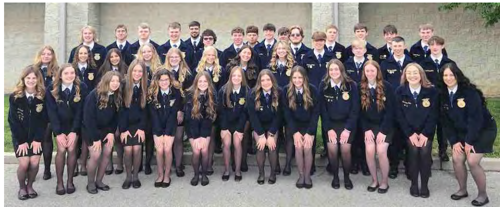
Pictured here are the 41 Paulding FFA members who attended the 95th Annual Ohio FFA Convention in Columbus May 3-5.