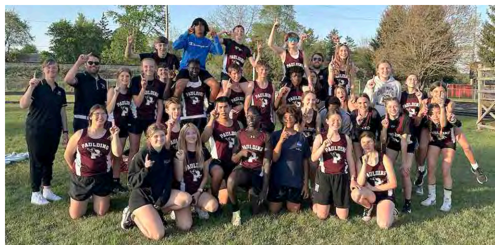
Congratulations to the Paulding JH boys and girls track teams who both won the Green Meadows Conference track meets Tuesday night in Hicksville! The Lady Panthers racked up 97 points to win the championship over second place Fairview (86-1/2) and third place Ayersville (79). Paulding's boys squad totaled 120 points in getting past second place Fairview (106) and third place Wayne Trace (74).

The Paulding boys and girls junior high track teams swept the Green Meadows Conference championships Tuesday night in Hicksville.