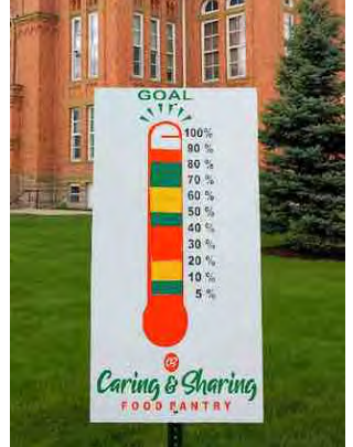
Pantry building fund thermometer displayed on Paulding County courthouse lawn.

On Tuesday, May 3, the fundraising thermometer for the Caring & Sharing Food Pantry building fund was posted in the county courthouse lawn showing just about 10 percent left to go to its goal! The campaign, which started in April 2022 with the Sing into Spring concert, has generated nearly 90 percent of the budget for the new building with the help of a very giving community and several special events.