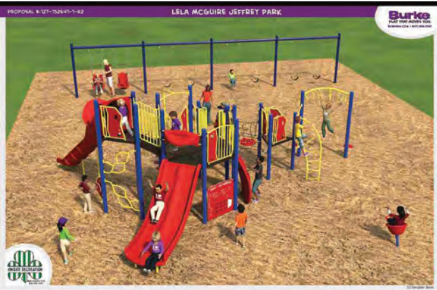
Rendering of the completed playground of Kiwanis Playground at Lela McGuire Jeffery Park.

The new Kiwanis Playground is located at the Lela McGuire Jeffery Park in Paulding. It is designed for all ages and abilities. It is currently under construction, but is scheduled to be completed in May 2023, if the weather cooperates.