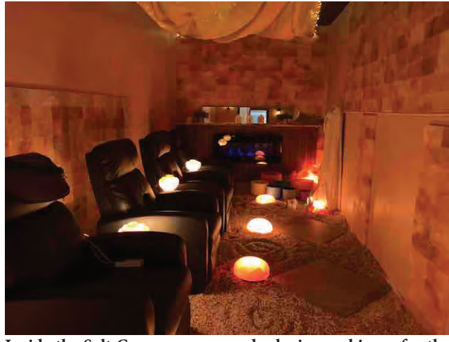
Inside the Salt Cave — serene and relaxing ambience for the guests' enjoyment.

The IRS has seized my assets, claiming that I'm building the ark in preparation to flee the country to avoid paying taxes. I just got a notice from the state that I owe them some kind of user tax and