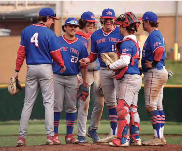
Raiders collaborate their game plan during a time out.