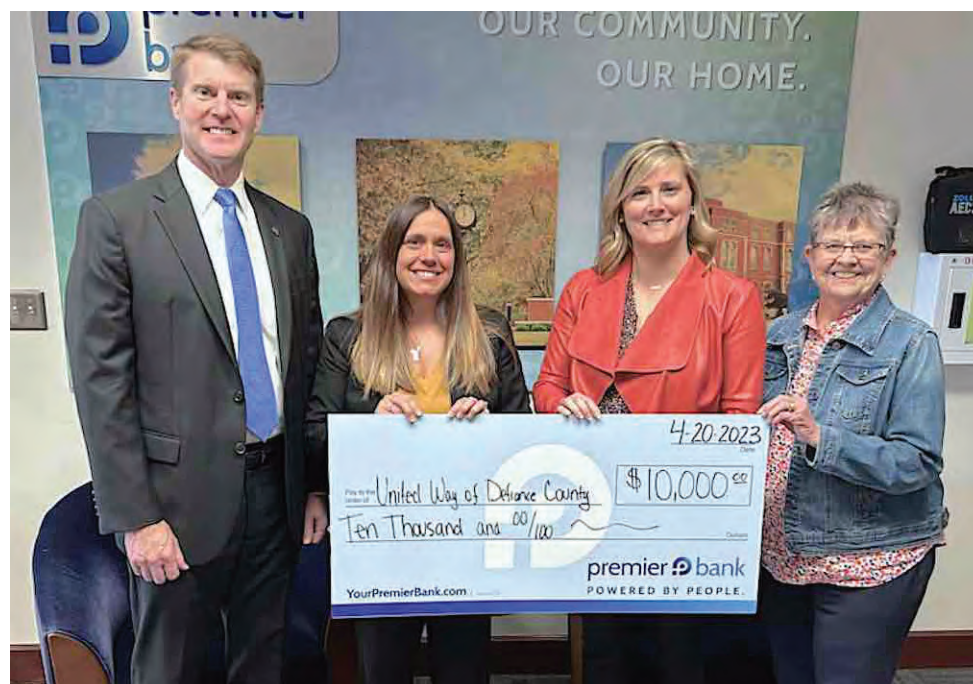
Premier Bank recently donating $10,000 to the United Way of Defiance County.