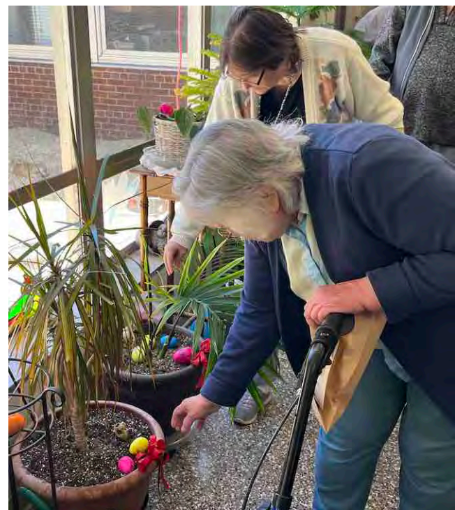
Antwerp Manor residents enjoy an afternoon of Easter egg hunting in the lobby.