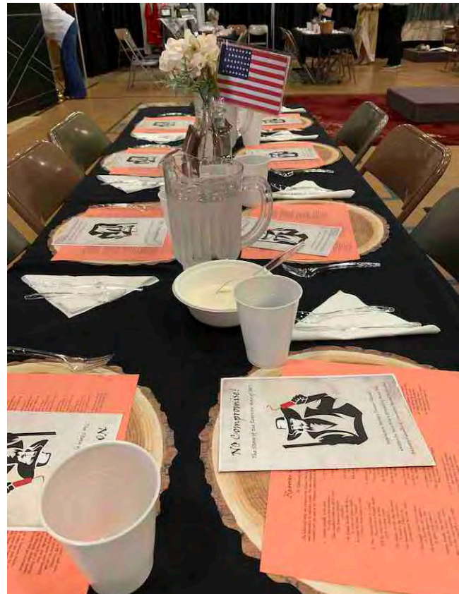
Place settings at the dinner theater complete with Program of the event as well as copies of the original Reservoir War song and an updated version written by Renee Boss.