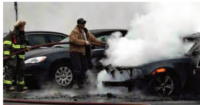
3/27 - Antwerp Police Department responded to a car fire at Antwerp School and assisted the school resource officer and the Antwerp Fire Department and EMS were called.

3/15 - An individual reported that her father had killed over 200 people and encased them inside of a capsule inside of a shed on their property. She was nine years old and he would put a pill on their body that would eat up their bones so there was no trace of them to be found. She further went on and named two individuals and said they had killed her 17 year old brother back in 1980 and her father covered up his death by paying off several people, such as an attorney in Paulding, a judge in Paulding and even the President of the United States at the time. She further went on to say that her mother was best friends with the president's wife. She also stated there were two bodies buried in the basement of the old Paulding jail and finished by stating that there are radio frequencies and lights all around and transmitting signals to her. The individual was questioned as to her drug use and the officer was further able to determine that she appeared to be a threat to herself and others and asked if she was willing to be taken to the Defiance Coping Center, which she agreed. The officer transported her to the Defiance Coping Center and turned her over. Approximately 40 minutes after dropping her off, the officer check with the Coping Center as to her condition and the Coping Center said she had been released and would be on her way back to Antwerp.