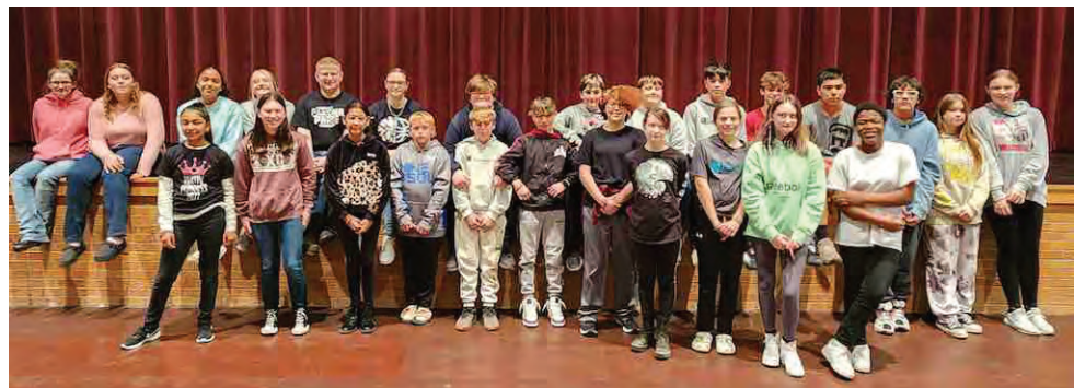
Paulding Junior High had 26 students in the month of February "get caught" doing something good by going above and beyond what is asked. Each student received a Paulding Pride bracelet and three were the lucky winners of a $5 Dairy Queen gift card. #TogetherAsOne

organic material, such as grass clippings, is an excellent way to provide micronutrients. They are absorbed by lawn grass plants from the soil and water by means of their root hairs. There are not always enough of these minerals present in the soil for a lawn grass plant to produce maximum healthy growth. This is why we fertilize the lawn. We also fertilize to supply nitrogen to stimulate lawn growth; however, this as in the case of mineral nutrients, is done to supply extra nutrients for lawn growth stimulation.