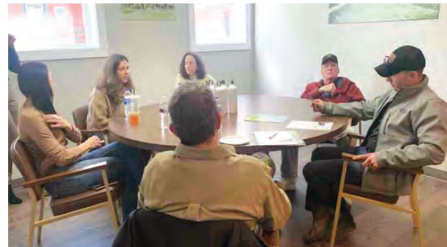
Geenex / Mink Solar representatives discussed the solar project & its impacts on the land and landowners at the recent Antwerp office open house.