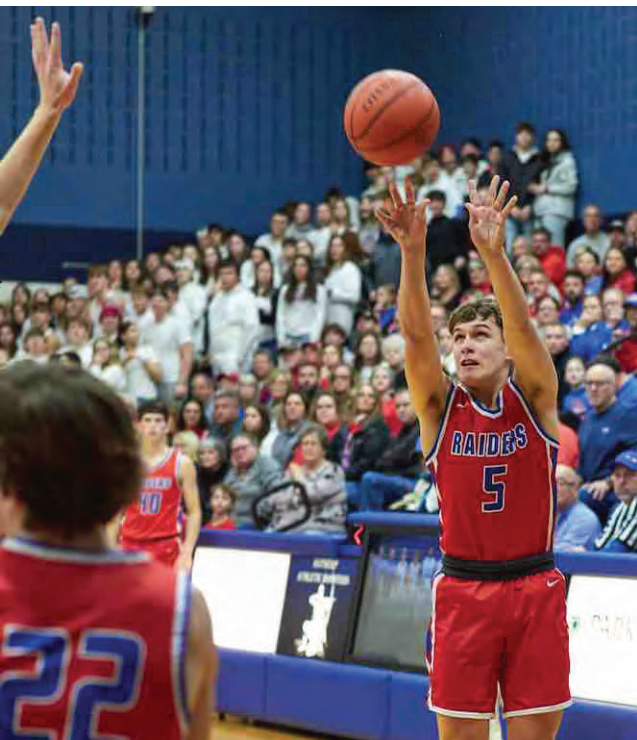
Wayne Trace freshman is left open for a three-point basket attempt! More pictures at westbendnews.net