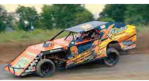
Photo Credit: Bill Griffith on the track at Montpelier Motor Speedway