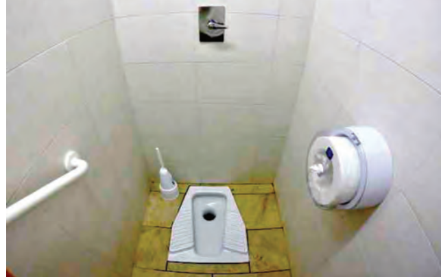
Here is a photo of those Turkish toilets I was writing about. People often don't keep public restrooms as clean as they should be. Simple Turkish toilets are often much cleaner as staff can hose down and disinfect things more thoroughly.