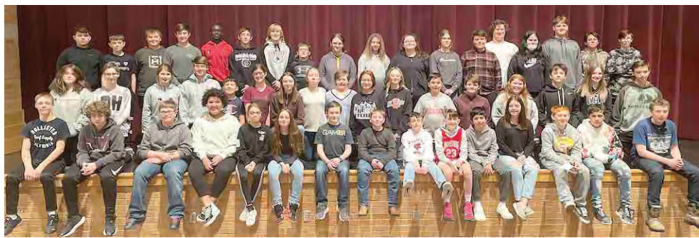
Each month students at Paulding Junior High School (PJHS) earn Paulding Pride cards for going above and beyond what is normally expected from a junior high school student. Shown in the picture are this month's Paulding Pride card recipients.