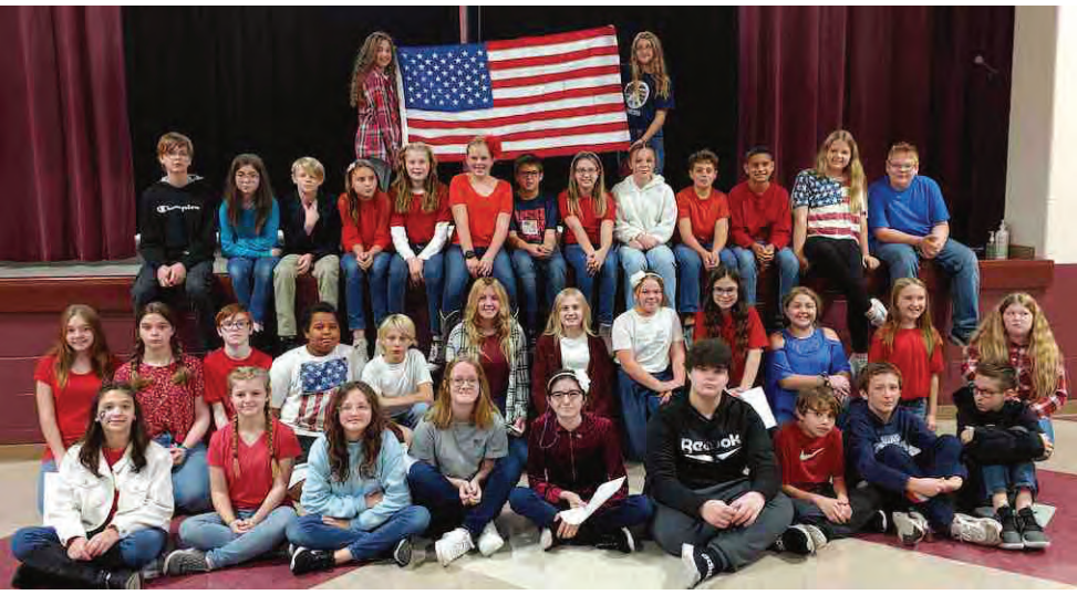
Shown are the sixth graders after the program.