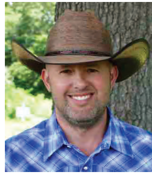
Moth Ball Cologne

decades that often had seen better days (threadbare, faded, and of a different style than I was used to). I made the journey up the windy creaky stairs to the lodging house's attic above the third floor, where the clothes were stored. In the dim light of the narrow attic, I began to find clothes I could wear the next day. Despite the clothes being from a different era and ill fitting, I had clothes to wear. I returned back down to my bedroom and was quickly asleep.