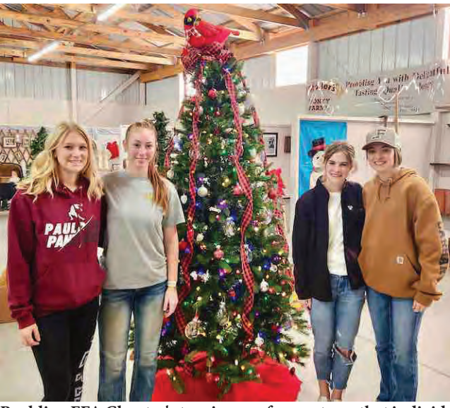
Paulding FFA Chapter's tree is one of many trees that individuals, groups and businesses have decorated for this year's Festival of Trees, Nov. 4-12 at John Paulding Historical Society in Paulding.

"Let Heaven & Nature Sing" is the theme for this year's Festival of Trees at John