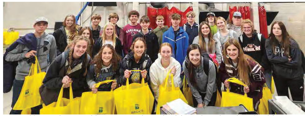
Pictured here is the 23 Paulding FFA members who delivered snack packs to local farmers as a thank you!