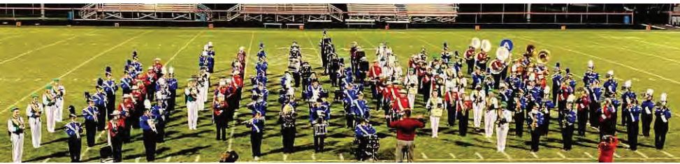
Members of the Antwerp, Lincolnview, Ottoville and Wayne Trace bands perform at the first annual Wayne Trace Band Bash Saturday night at Raider Field. The four bands each put on their individual band shows before joining together in the finale of an entertaining and well-attended evening.

The WT Marching Band held their first annual Band Bash on Saturday, October 8, 2022. Antwerp, Lincolnview and Ottoville joined Wayne Trace to showcase their shows on the field and then everyone played "Heartache Tonight" as a finale. The fans in the stands also had a friendly competition where they had to complete tasks for points. The Lancer fans won the coveted "Band Bash Drum Head Award"!