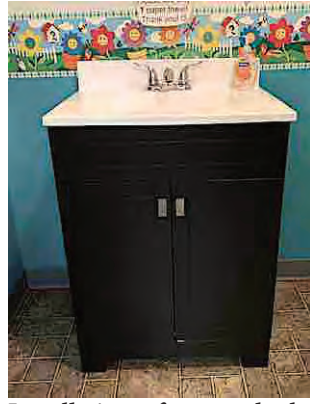
Installation of a new bathroom sink for the littles at Ann's Bright Beginnings by My Father's Hands Handyman Services.

A NatureWorks grant was applied for in the amount of $60,000. The village received an award notice and the notice to proceed with the said