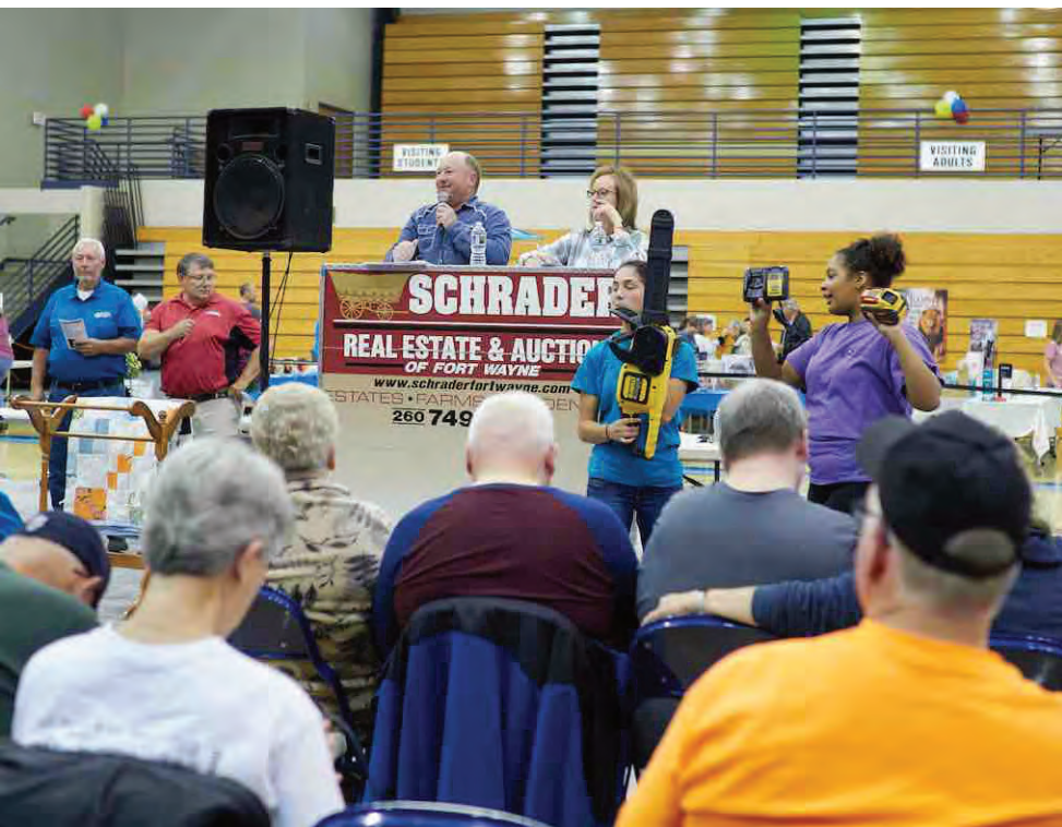
Schrader Auction Company officiates the Live Auction at the Woodburn Christian Children's Home Benefit auction each year.

The Woodburn Christian Children's Home has been blessed by the community with the annual fundraiser auction that took place on Saturday, October 8 at Woodlan High School. The 17th Annual Benefit Auction and dinner is the main fundraiser for the non-profit organization to ensure the best education and training for the children that have come from less than ideal circumstances.