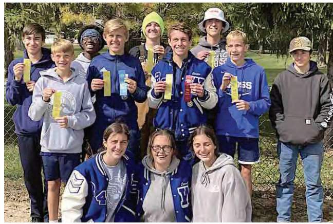
Warrior cross country team finished 4th at sectionals!