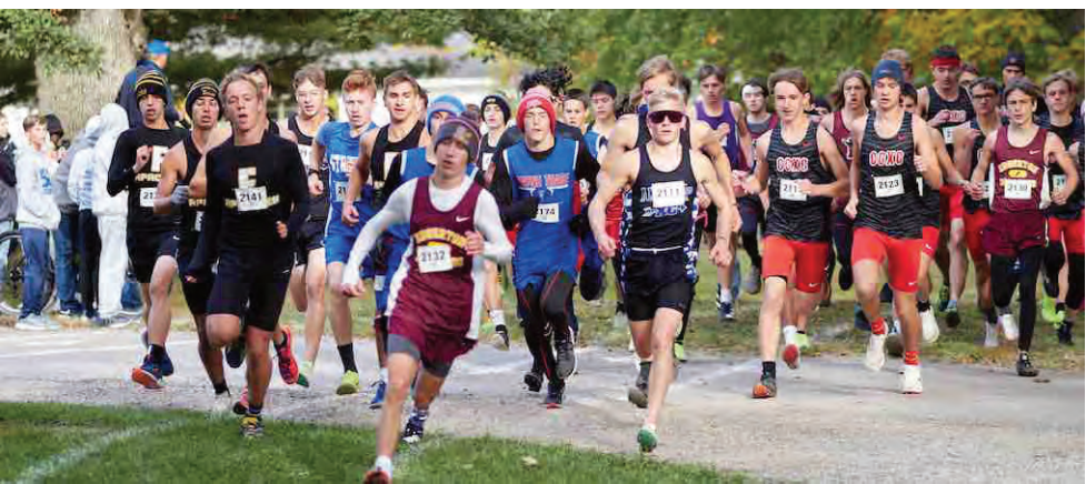
Boys ran after the girls at the Antwerp Invitational on October 8, 2022. In team scores, Fairview took 1st place followed by Hicksville and Antwerp. More pictures at www.westbend-news.net