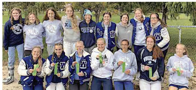
Lady Warrior cross country team finished 5th at sectionals!

On to Regionals for Woodlan Warriors Cross Country Teams! Lady Warriors finished in 5th place and Men Warriors finished in 4th place.