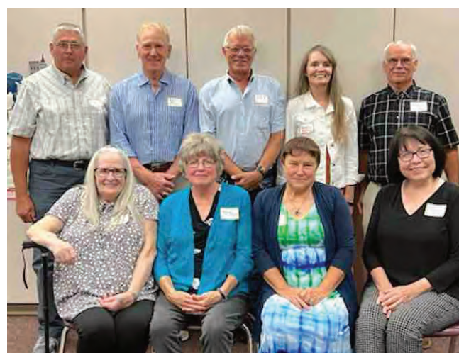
Oakwood HS Class of 1972. They were the first graduating class that went from Oakwood to Paulding after the merger.