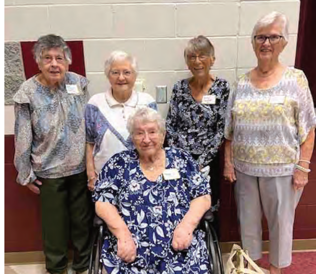
Oakwood HS Class of 1952 who graduated 70 years ago.

The Oakwood Alumni met recently at the Oakwood Elementary school. There were 171 in attendance from the classes of 1945 thru 2013. The classes honored were 1950 & 1951, 1960 & 1961 and 1970 & 1971. Both years were honored since the Pandemic closed it down last year. An evening of catching up and reminiscing was enjoyed by all. Dinner was provided by the Lock 16.