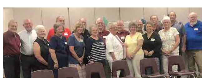
Oakwood HS Class of 1962 who graduated 60 years ago.

The deadline for the West Bend News is THURSDAYS at 5pm for the following issue. Send your news, ads, and classifieds to info@westbendnews.net Call 419-258-2000 for information or printing quotes.