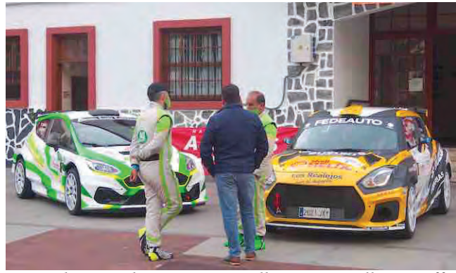
A race driver and navigator are talking to a small-town official outside the town hall. Road racing provides a boost to small-town economies as race teams and fans spend the weekends lodging and eating there. It just causes a bit more work for the local officials who have to re-route disoriented drivers trying to use the public roads.

their visit each fall. If you are considering Assisted Living, please give us a call at 419-258-1500. We would love to assist you.