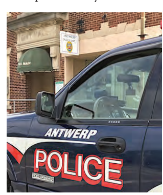
ANTWERP POLICE REPORTS