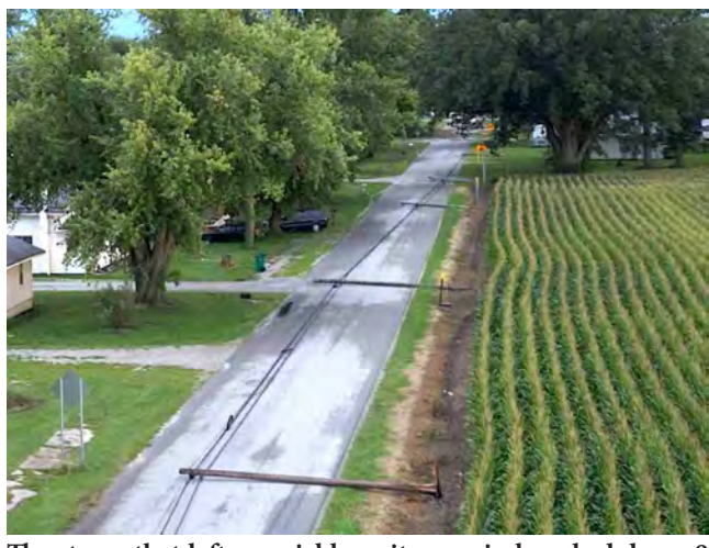
The storm that left as quickly as it came in knocked down 9 power poles in the small town of Cecil in north central Paulding County, Ohio. Other places that had damage include Paulding, and Antwerp and other towns throughout. The last tree standing from the Sugar Beet factory also fell in this storm.