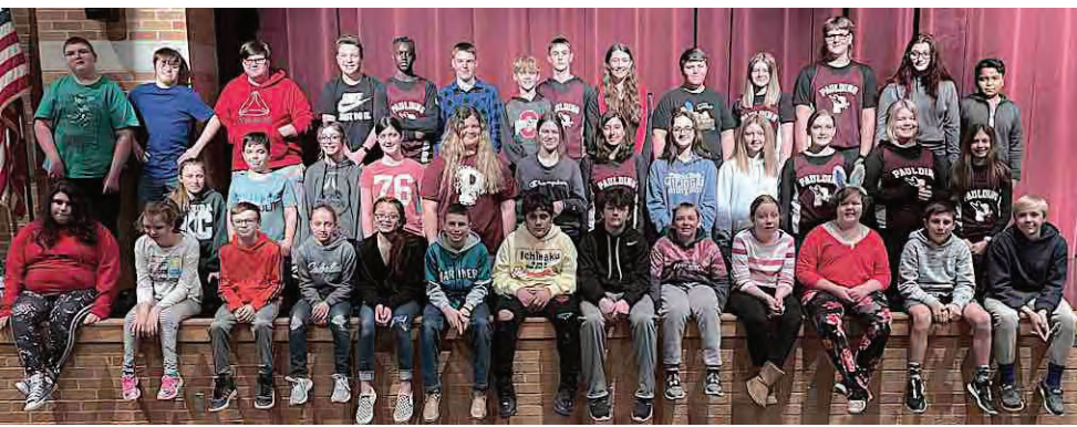
Each month students at Paulding Junior High School (PJHS) earn Paulding Pride cards for going above and beyond what is normally expected of Paulding Junior High students. Shown in the picture are the Paulding Pride card recipients for the month of March.