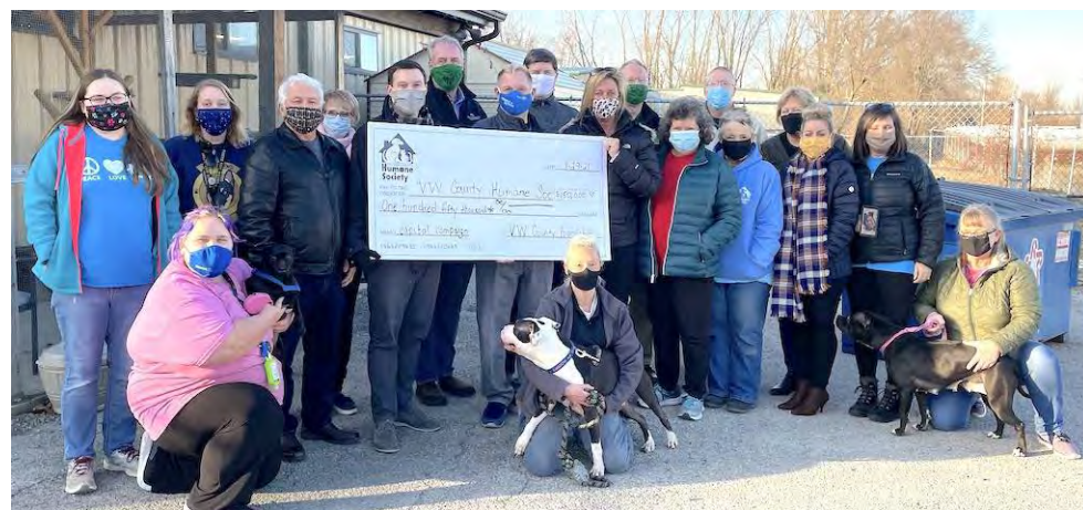
Pictured here are VWCF Staff & Board of Trustee Members with Board & Staff of the Van Wert County Humane Society - along with current and past shelter animals.

The Van Wert County Foundation (VWCF) intends to give $150,000 in support of the Van Wert County Humane Society's Building Project. The Van Wert County Foundation administers the 2021 grant support provided by The Associated Charities Fund, The Flickinger Memorial Trust, and The James A. & Minnie C. Kesler Memorial Fund.