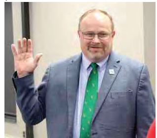
PUBLIC HEALTH UPDATE