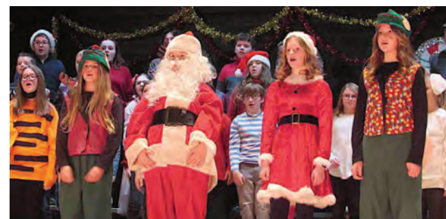
On December 17, Payne Elementary 4th, 5th, and 6th graders presented the 2021 Christmas Program.