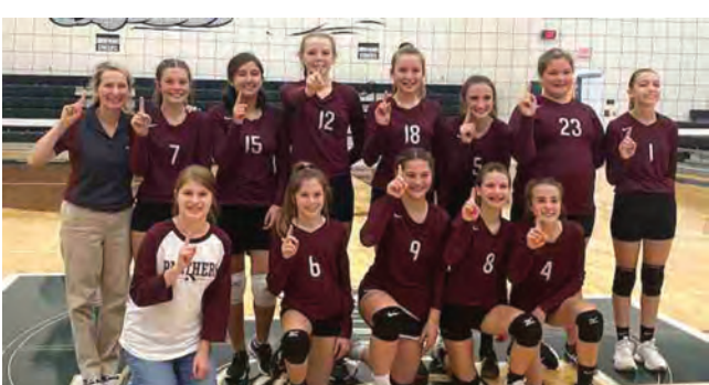
The Paulding seventh grade volleyball team won the GMC championship Saturday, October 16th by winning the GMC tournament held at Tinora. This tournament win topped off a perfect season for the Paulding Middle School seventh grade volleyball team. Shown in the picture are members of the team.