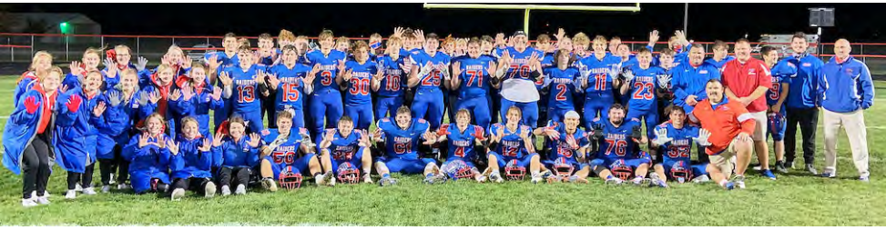
Raiders hold up their hands indicating they have now won the trophy 10 straight years. More pictures at westbendnews.net