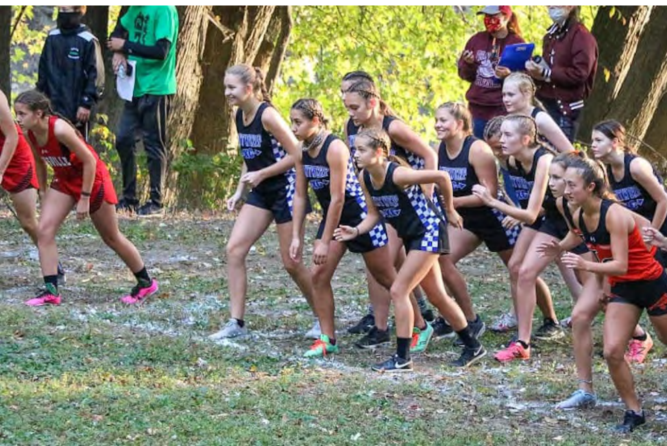
At the starting line of the Varsity girls race of the Antwerp Archer Cross Country Invitational on Saturday, October 10, 2020.