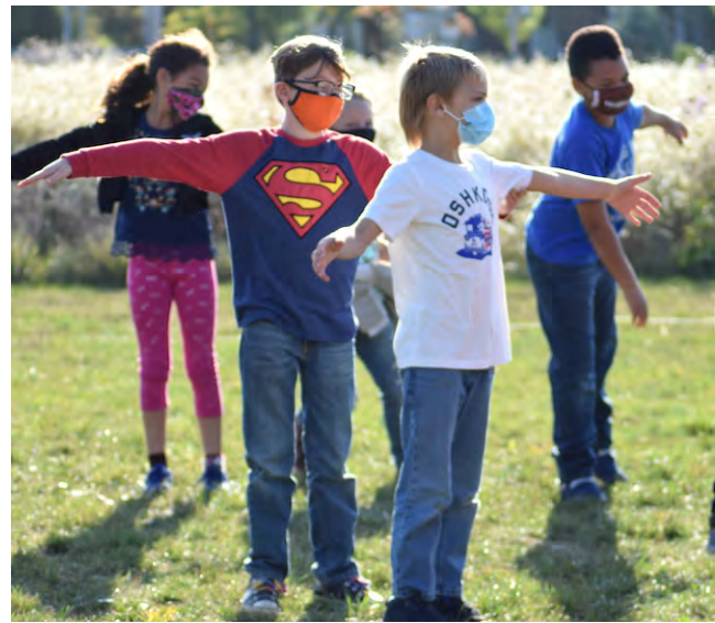
Erosion activity: Third graders engage in an activity that teaches them about erosion.