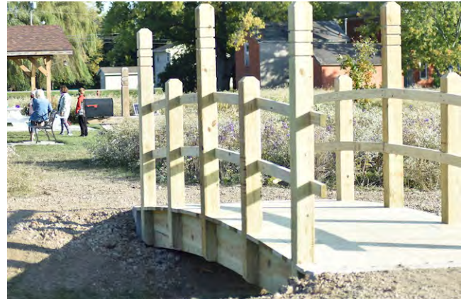
Bridge: The Mabises recently finished building a bridge that allows students and staff to more easily access the native prairie garden from the school.