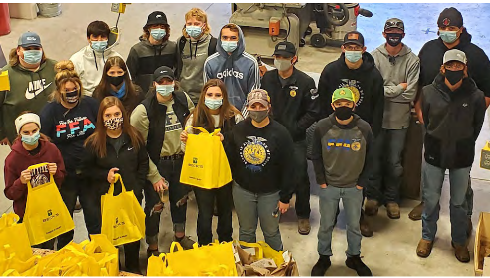
Here are the 17 Paulding FFA students who delivered snack packs to the farmers in Paulding County.