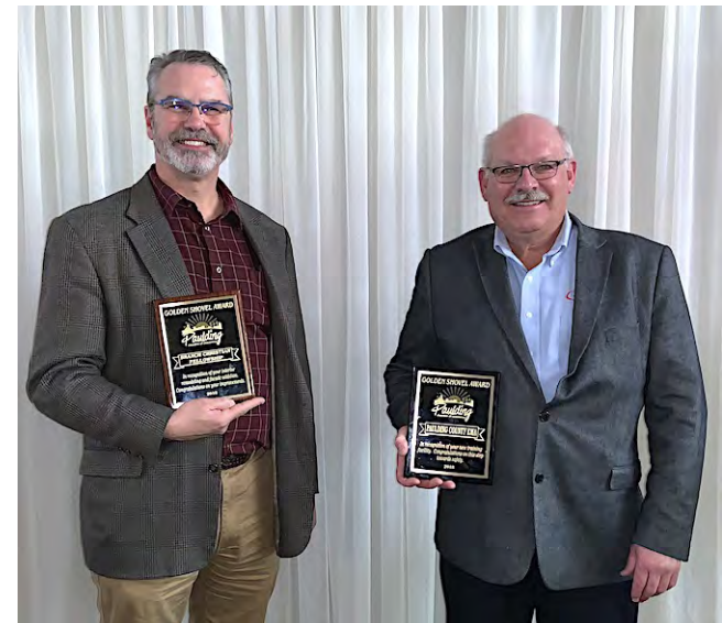
Golden Shovel Awards – Stykemain Chevrolet (not pictured), Branch Christian Fellowship, and Paulding County EMA.