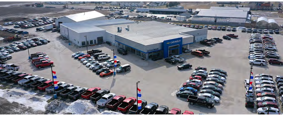
Showing the Stykemain Chevrolet campus. The new construction is on the back left attached to the main building.

Driving on the north side of Paulding you may have noticed a large construction project happening at Stykemain Chevrolet. The new construction is attached to their already newer facility that they built several years ago. The building is host to their massively upgraded Stykemain Body Shop!