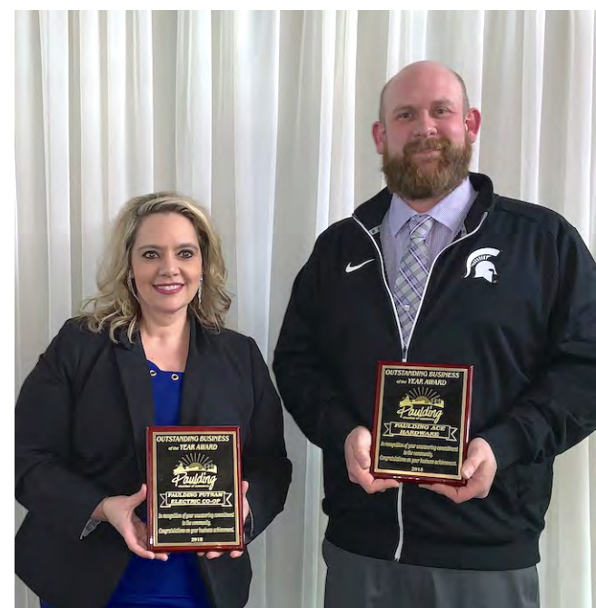
Outstanding Business – Paulding Putnam Electric Co-op and Paulding Ace Hardware.