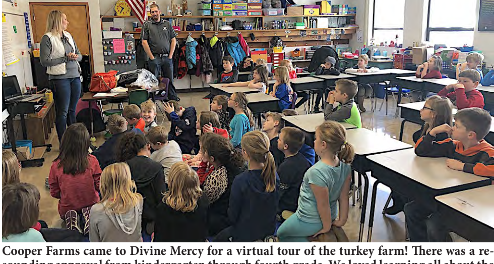
Cooper Farms came to Divine Mercy for a virtual tour of the turkey farm! There was a resounding approval from kindergarten through fourth grade. We loved learning all about the facilities, animals, and workers. The most popular part seemed to be watching the turkey be caught!

them eternal life; and they shall never perish, neither shall any man pluck them out of my hand."