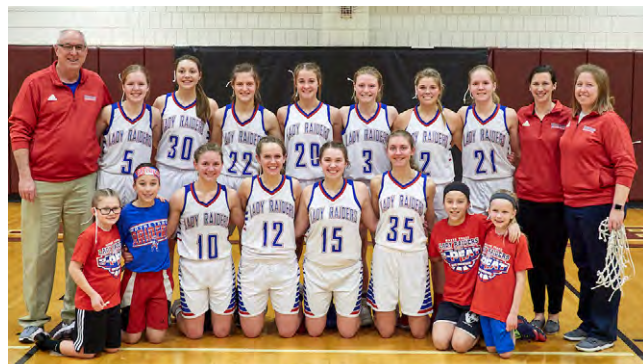
Wayne Trace Ladies Win Sectionals! More pictures at westbendnews.net