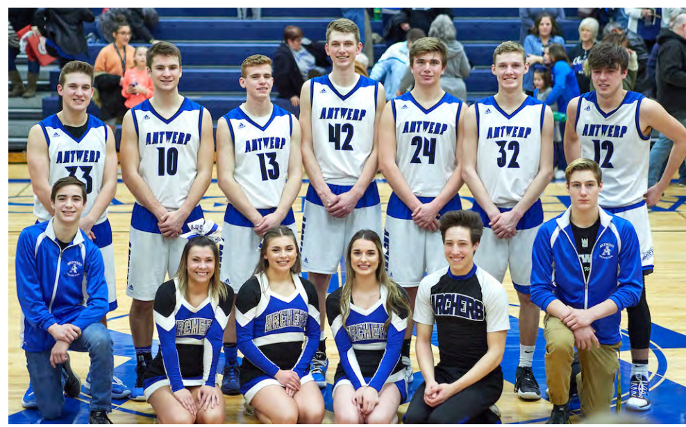
The Antwerp senior athletes are recognized at the last game. More pictures of westbendnews.net

The regular season of the Antwerp Archers basketball came to an end Monday night with the seniors playing their last game at the Range defeating Delta 57-32 and finishing the season 16-5. The Archers shot 23/39 from the field, 7/9 from the free throw line, brought down 27 rebounds and com-