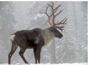
Photo of Woodland Caribou, a subspecies of reindeer.