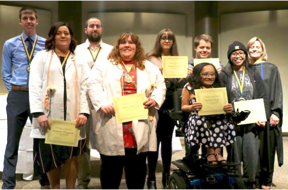
Pictured here are the NSCC Award of Merit recipients

Archbold, Ohio - Northwest State Community College recently honored students achieving academic excellence during its Fall Honors Ceremony, held on December 6th. Phi Theta Kappa, Alpha Delta Nu and Award of Merit students were recognized during the one-hour ceremony, held in the Voinovich Auditorium on the College's Archbold campus.