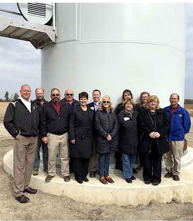
Paulding County officials visit the new wind farm under construction! More pictures at westbendnews.net

On Friday, October 25 the Paulding County Commissioners hosted representatives and commissioners from around the state of Ohio along with Paulding County officials right here at the new wind farm called Paulding Wind Farm IV (5th Project). This new project will be adding 31 turbines to the area.