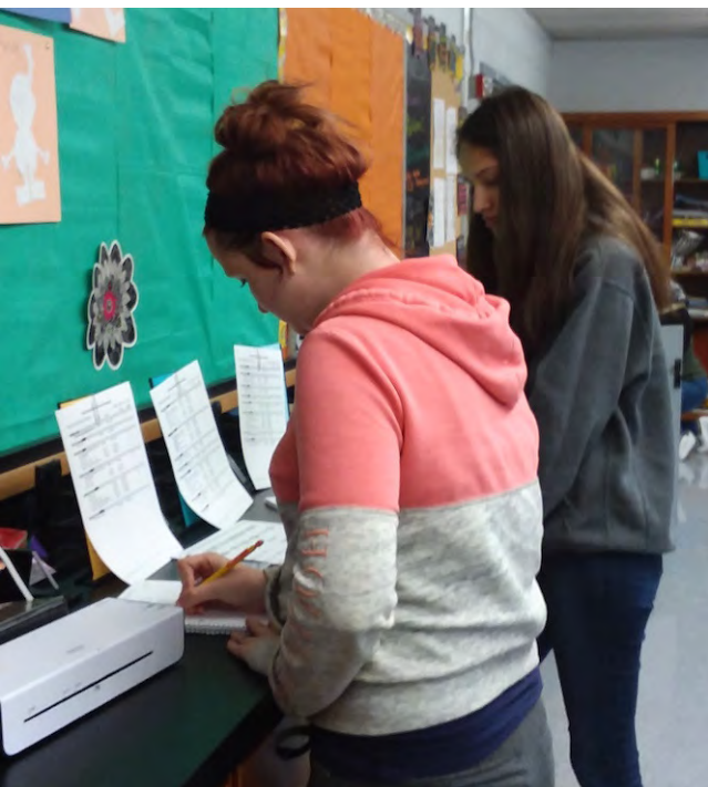
Geometry students at Synergy Learning Center working together to solve a Mad Lib by combining like terms.