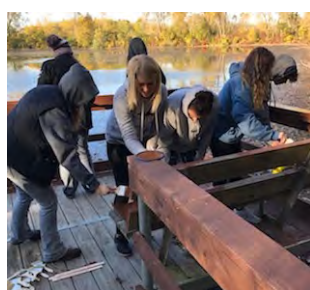
Students are working on applying a protective stain to one of the docks at the Black Swamp Nature Center.

Paulding High School and Paulding Soil & Water Conservation District (SWCD) once again collaborated to hold a Community Service Workday at the Black Swamp Nature Center. Over 350 students in grades 9-12 from Paulding High School and their teachers braved the cool fall weather to make a big difference in their local community. This is the second community service day that has been done by the students.