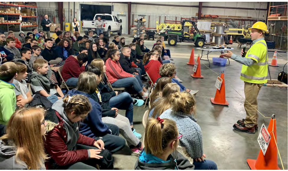
Nearly 100 middle schoolers watch North Western Electric Cooperative's high-voltage safety demonstration, where a hot dog was lit on fire and proper technique for exiting a vehicle near downed power lines was demonstrated.

BRYAN, OH — HIGH-voltage safety demonstrations, solar field tours, bucket truck shows, "dress like a lineman" games, and interactive presentations answering the following: What is a cooperative, and what does it take to keep the lights on? Nearly 200 Fairview and Hilltop middle schoolers did all this and more at North Western