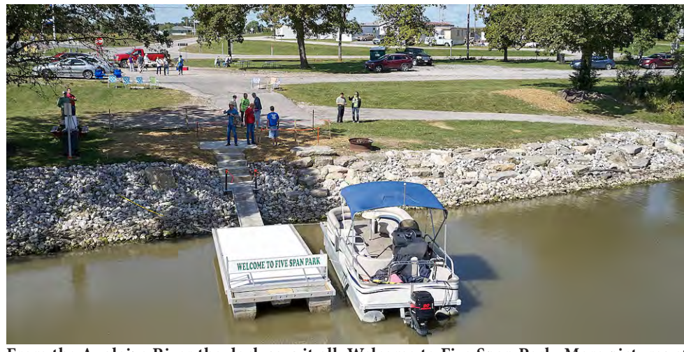
From the Auglaize River the dock says it all: Welcome to Five Span Park. More pictures at westbendnews.net

Online condolences may be shared at www.smithbrownfuneralhome.com.