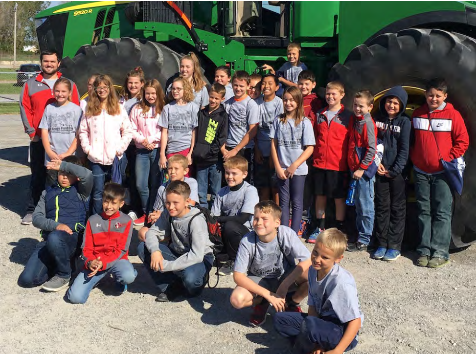
Students from Divine Mercy enjoying the Farm Safety Session at the 2018 field day.