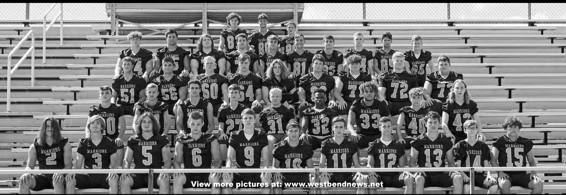
View more pictures at: www.westbendnews.net