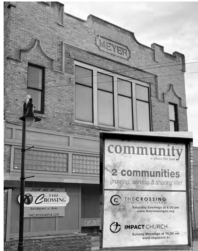
The installation of the vinyl is just finished as the storefront building is cleaned up from the ladders and tools needed to finish.