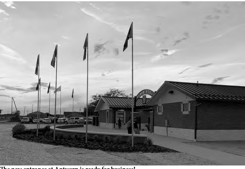
The new entrance at Antwerp is ready for business!