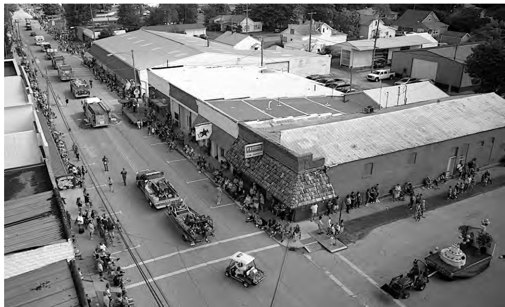
The Oakwood Homecoming parade took place on September 2 with beautiful weather in the Paulding County Village of Oakwood. Shown here is the Fire and EMS in the line who serve the community every day. More pictures at westbendnews.net

The Village of Oakwood celebrated their annual Homecoming this Labor Day Weekend. There was much for the kids to do throughout the town along