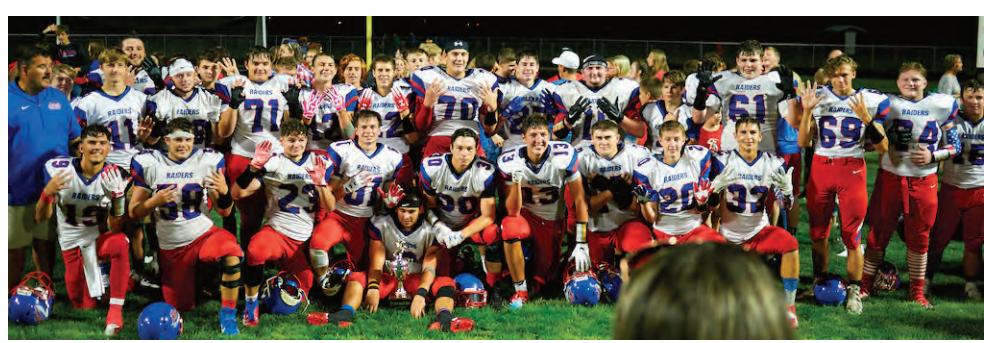
Wayne Trace 2019 Football team with the Black Swamp Trophy. More pictures at westbendnews.net

PAULDING - The 2019 edition of the Black Swamp Bowl had fans from both sides of the field on the edge of their seat but when the the scoreboard showed 00:00 it would be the Wayne Trace Raiders claiming the opening season win 28-27. The competitive game was in doubt throughout most of the contest. Paulding, trailing by one, decided to go for the win with 1:45 remaining. Going for a two-point conversion, Panther quarterback Payton Beckman's pass attempt would not materialize and the Raiders escaped with the one-point win.