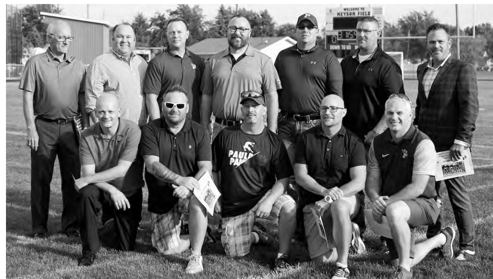
Paulding's 1992 Baseball team honored at Keysor Field on Friday, August 30, 2019.