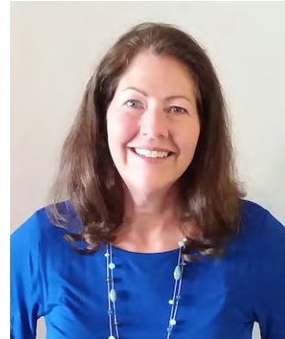
The Paulding County Carnegie Library Board of Trust-