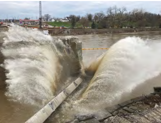
Speaking of demolition, this photo of the last bridge beam falling into the river was provided to us by the contractor. This occurred on Thursday of last week.

The following is an update regarding the progress of the Clinton Street bridge project, downtown Defiance. The $8.3 million project will completely replace the bridge which carries state Routes 15, 18 and 66 over the Maumee River. The bridge closed Feb. 25, 2019 for approximately nine months. The project is scheduled for completion July 2020.