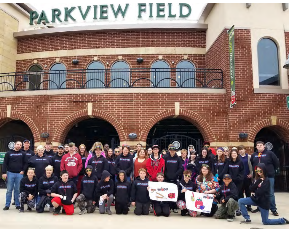
SYNERGY Learning Center students attended a Ft. Wayne Tin Caps game on April 24, compliments of the Tin Caps Reading Program. Huge shout out to the Tin Caps for a great day!!!