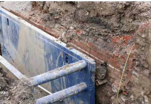
The brick foundation of the former brewery is pictured here alongside the trench box.