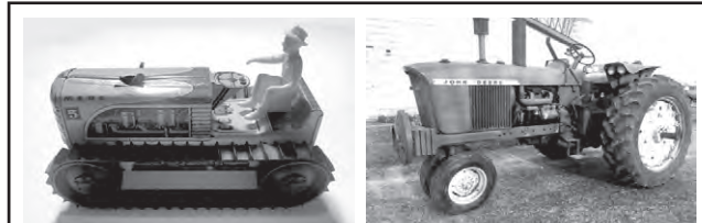
John Deere Tractors, Case 530 Backhoe, Tools, Vehicles, Antiques, Toys & Personal Property