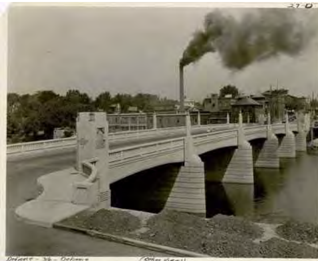
Bridge from 1880s