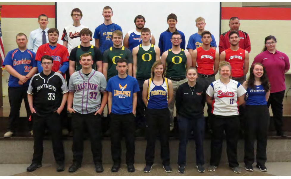
Vantage students who participate in a spring sport at their home school were recognized recently on Spring Sports Spirit Day. Wishing all student athletes good luck and a great season!