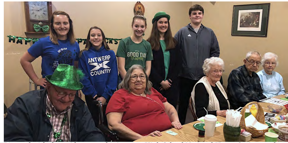
Pictured with the residents are the Antwerp High School National Honor Society students who provide us with a Saint Patrick's Day party each year, complete with bingo, prizes, and yummy treats! The residents of Antwerp Manor appreciate the Antwerp Local School and how well they include us in their school activities.

The non-mineral nutrients are hydrogen, oxygen and carbon. These nutrients are found in the air and water that surrounds us. In a process called photosynthesis, green plants use energy from the sun to change carbon dioxide, from the air, and hy-