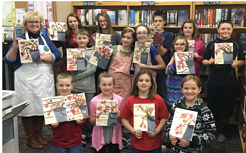
Youth canvas art classes are popular throughout the library system.

The Paulding County Carnegie Library system celebrates public libraries every day, but invites you to stop in to your favorite branch or the main historic Carnegie library in Paulding during National Library Week. The week of April 7th is set aside nationally to as a time to celebrate the contributions of our nation's libraries and library workers and to promote library use and support.