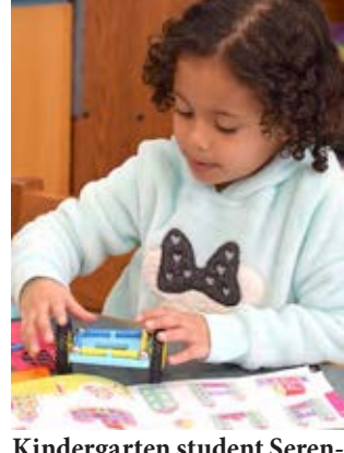
Kindergarten student Serenity Smith uses the magnetic building set to make a vehicle.

Continuing with Antwerp Local School's goal to make students STEAM ready (science, technology, engineering, art, and math), kindergarten and first grade students at Antwerp Elementary are now participating in age-appropriate stations during library time. Stations include LEGOs, puzzles, art/origami, magnetic building kits, and a space building set. Students in grades 2 through 5 started creating and inventing in similar stations earlier this school year.