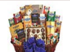
NUMEROUS GIFT BASKETS