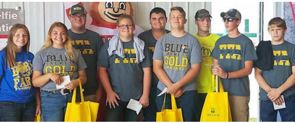
Pictured here is a group of FFA students learning more about agriculture at FSR