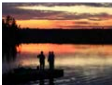
CANADIAN FISHING TRIP