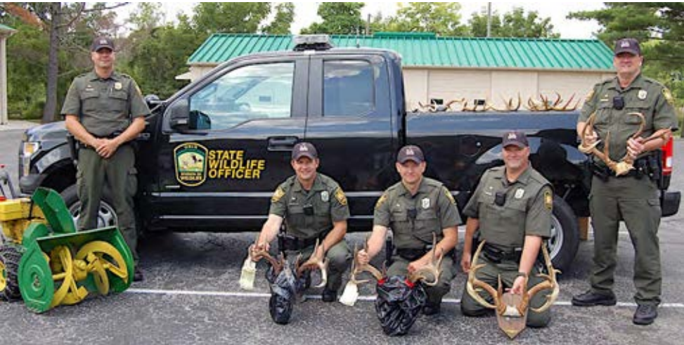
ODNR Division of Wildlife Law Enforcement Staff with evidence from the case is attached.

Two Lucas County residents were recently convicted in Henry County Common Pleas Court following a two-year poaching and theft investigation by the Ohio Department of Natural Resources (ODNR), Division of Wildlife.