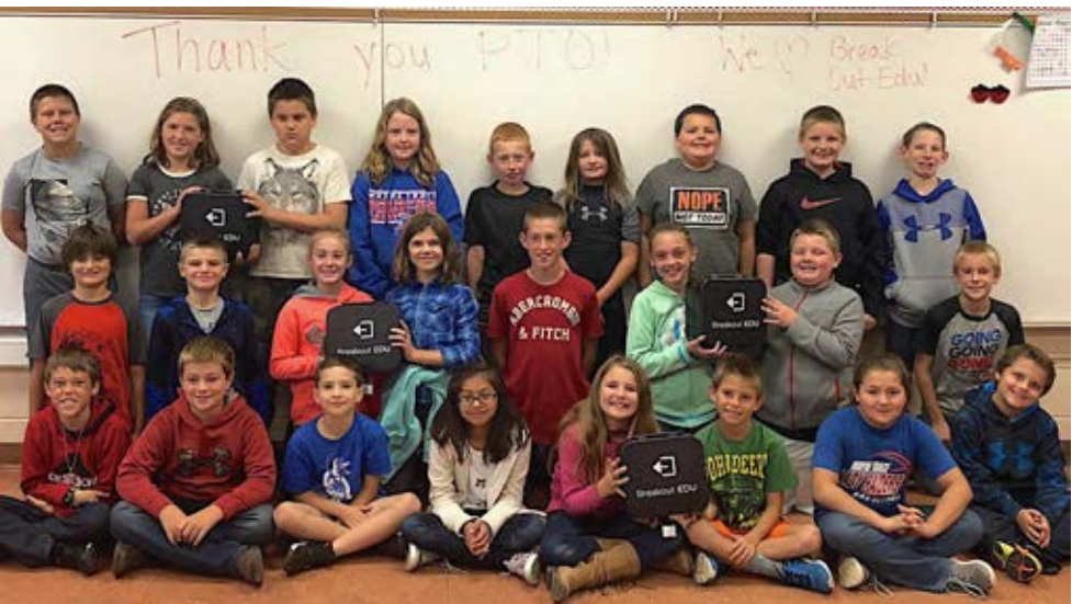
The students at Grover Hill would like to say thank you to the PTO for purchasing Breakout EDU boxes. Breakout EDU boxes encourage collaboration, critical thinking skills, and teamwork in order to “break into” the box. Pictured are the fourth-grade students after completing their first “Breakout”.