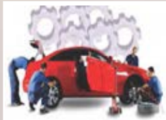
VEHICLE & AUTO