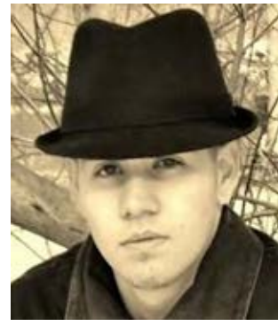
An Angel's Heart Begins A New Start