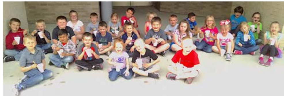
The Oakwood Elementary PTO provided snow cones for all students on Field Day! The Kindergarteners enjoyed them very much!

county residents and local businesses. In June of 2018 the EMA, in partnership with the Sheriff's Office, upgraded to NIXLE 360 so that Paulding County could improve overall communications to those we serve.