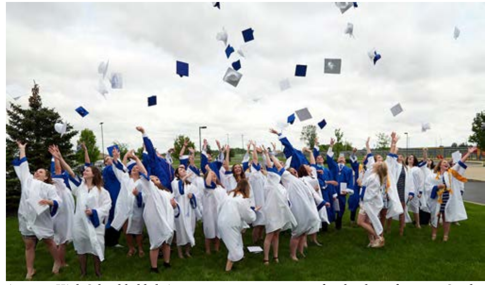
Antwerp High School held their commencement ceremony for the class of 2018 on Sunday May 20, 2018. 42 students earned the status of High School Graduate. Pictured above are the students, doing the traditional tossing of the cap.

ANTWERP HIGH SCHOOL CLASS OF 2018: YOU MADE IT!