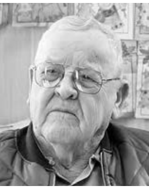
MY TALK WITH DISTRICT TWO