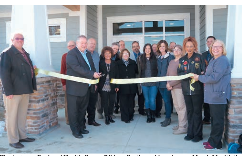
The Antwerp Regional Health Center Ribbon Cutting taking place on March 22 with the Antwerp Chamber of Commerce.

The -Paulding County Hospital held their Grand Opening of the Antwerp Regional Health Center on March 22nd. This construction started less than 8 months ago. The ground breaking back in the summer was a major event and the following construction went very quickly. The contractor CME Corporation out of Fort Wayne completed the job in a timely manner.