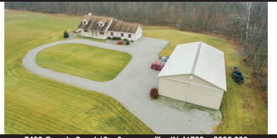
7402 County Road 68 • Spencerville, IN 46788 • $385,000

1035 West Wayne Street • Paulding, Ohio 45879 • 419.399.1138