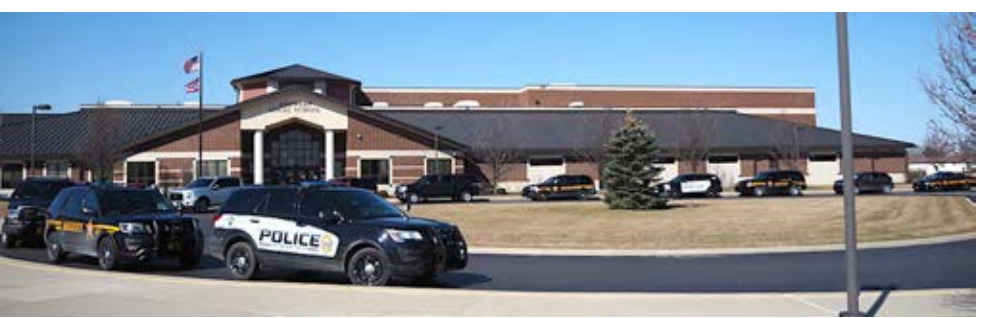
Paulding County Sheriff's Office and local police train for emergency lockdowns at the Antwerp Local School on March 4.

PAGE 7 – WEST BEND NEWS – MARCH 20, 2018 THIRD GRADERS BECOME "JUNIOR GEOLOGISTS"