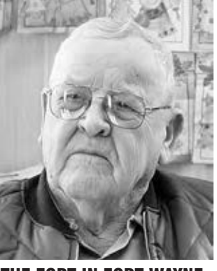
THE FORT IN FORT WAYNE

Phone: 419-258-2000 • Website: www.westbendnews.net