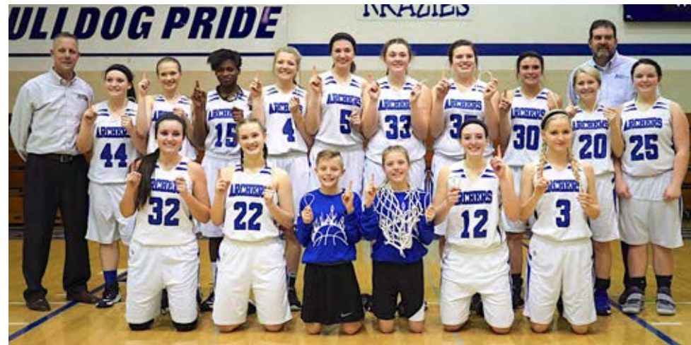
The Antwerp Archers claim Sectional Victory after defeating the Tigers at Defiance. More pictures at westbendnews.net

The Holgate Tigers defeated Edon in the first round of sectionals in a 19 point victory, shooting them to the top of the Sectional Final game against the Antwerp Lady Archers, who had a first round bye.