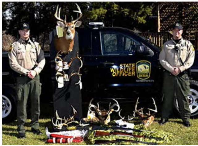
Some of the evidence seized from the northwest Ohio portion of Operation North Coast.