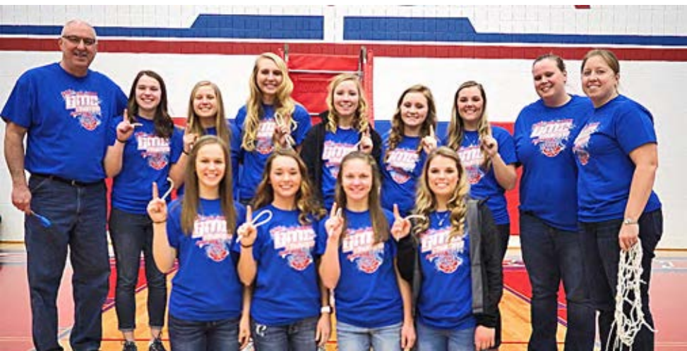
The Lady Raiders Win the Green Meadows Conference title after defeating the Rams.

On Thursday night, February 16th, the Lady Raider of Wayne Trace traversed to the Tinora school district for high school girls basketball action. And action it was! The Lady Raider dominated the Ram's court taking a 10 point lead at the end of the 1st quarter. Wayne Trace kept their lead at the half time buzzer acquiring 8 more points than their opponent in the 2nd. In the second half of the game, the scoring slowed up for both teams, but Wayne Trace still lead the scoreboard