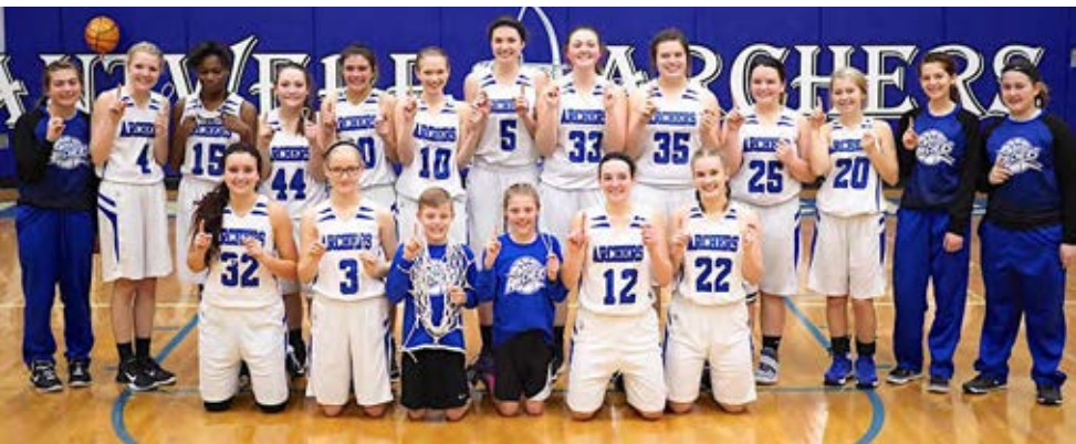
The 2017 Green Meadows Conference Champions. More pictures at westbendnews.net