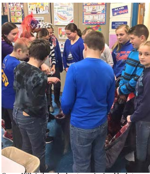
Grover Hill sixth grade class toss coins in a blanket