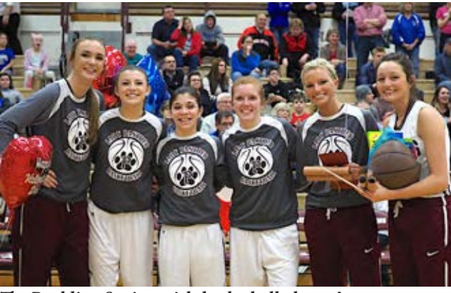
The Paulding Seniors girls basketball players!

It was senior night on February 14 for the Lady Panthers. All of the young ladies have had a great time playing as a team for their favorite school and now it's time to say, "goodbye" for the last home game of the season. These girls have some of the best attitudes around when you see they gave balloons to the seniors of their