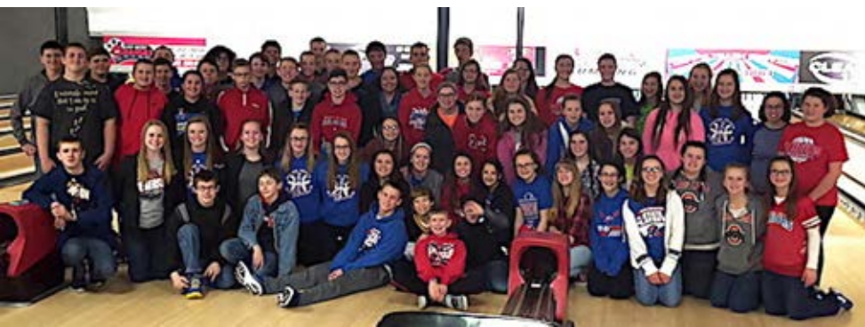
71 Wayne Trace JH students recently spent the afternoon bowling at Olympic Lanes in Van Wert. The students qualified for the afternoon of fun by having good grades, no attendance or discipline issues, no tardies, and no late homework assignments. Way to do a GREAT job Raiders!!!