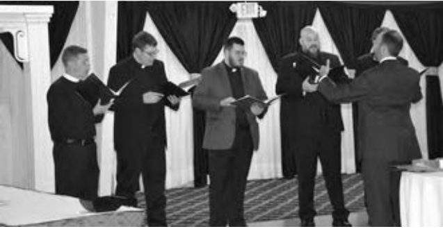
The Kantorei from Concordia Lutheran Seminary, Fort Wayne performed special music for the occasion. Thanks and praise to God were offered. Reunions and memories were shared.

Mt. Calvary Lutheran Church celebrated its 50th year of ministry in the present church building located on west Co. Rd. 424 in Antwerp. On Sept 17, 2017,