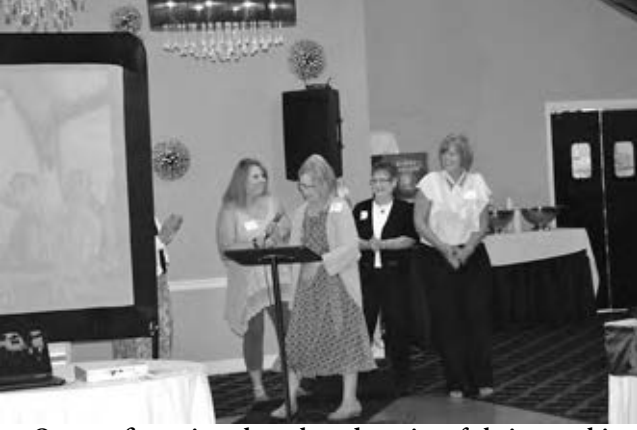
One confirmation class shared stories of their catechism class and youth group of former days.

a re-dedication service was held at the church with a luncheon and program at Grant's following. Over 160 people from Antwerp and surrounding area attended.