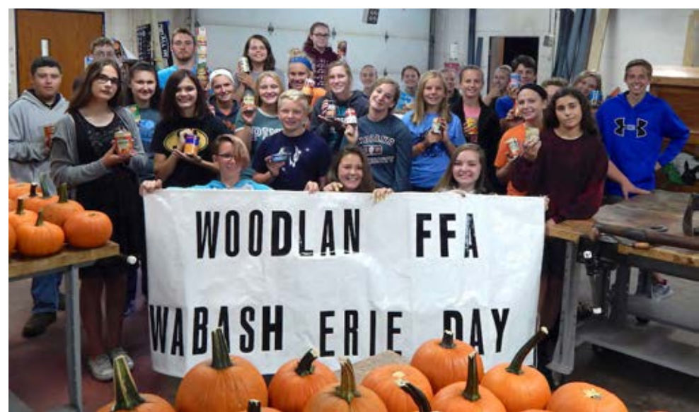
Pictured are the Woodlan SAE and Intro. to Ag. Students.