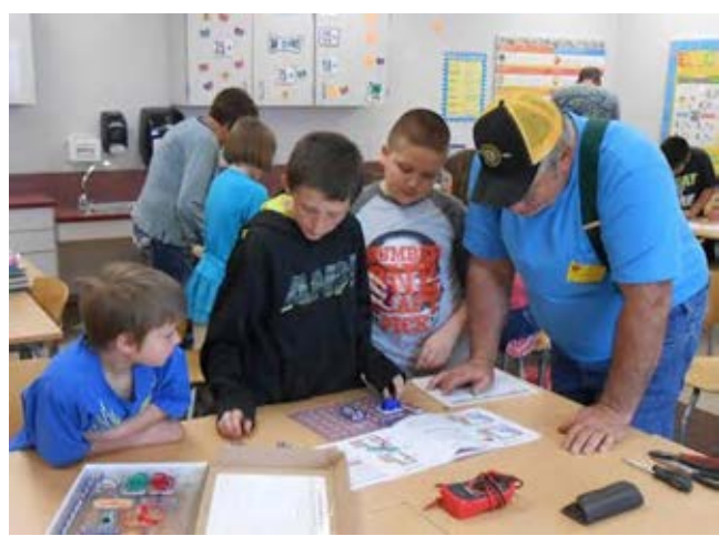
The fourth grade at Oakwood Elementary School enjoyed "Electricity Day" as a wrap-up to their unit on electricity. Parent and grandparent volunteers came to school to help the students build and learn about electricity circuits using a kit called Snap Circuits. The students and adults had fun building circuits that lit up, played music, and launched a fan. A special thanks to Cooper Farms as the Snap Circuits were purchased through a Cooper Education Grant.

In my way of thinking, the government has gone with those costly sorting machines in the Columbus district office and to keep them busy, bring all the day's mail to them at the expense of employment at the small offices and the wasted three day travel time.