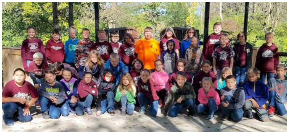
The Oakwood fourth graders took a field trip to Grand Rapids, Ohio to ride the canal boat and visit the mill. Shown is a group photo of the students after completing the boat ride.