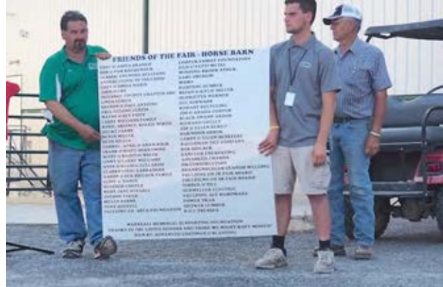
The Friends of the Fair Horse barn contributors are recognized.