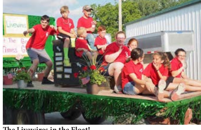
The Livewires in the Float!