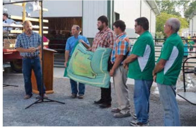
Paulding County Commissioners present the County Flag to the JR Fair Board Reps.