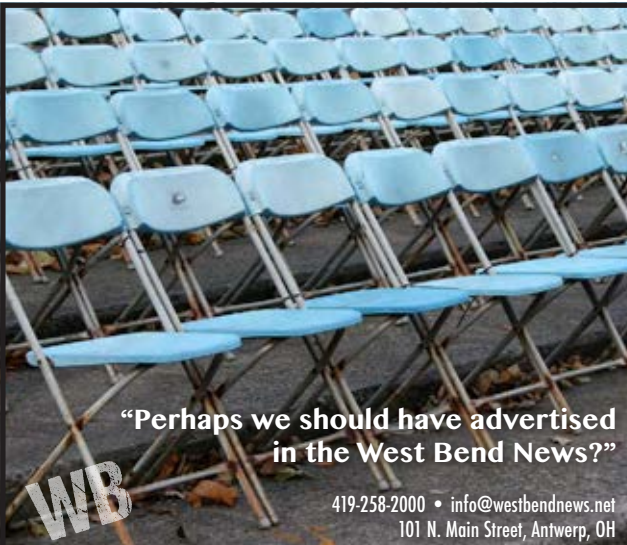
"Perhaps we should have advertised in the West Bend News?" 419-258-2000 • info@westbendnews.net 101 N. Main Street, Antwerp, OH

Questions on the proposed public hearing should be directed to the Village Administrator by calling 419-258-2371.