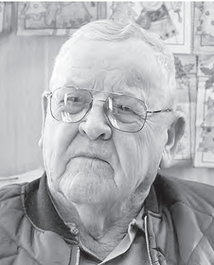
AUTO BY OTTO: 5 (THE LAST OF "MEMORIES")