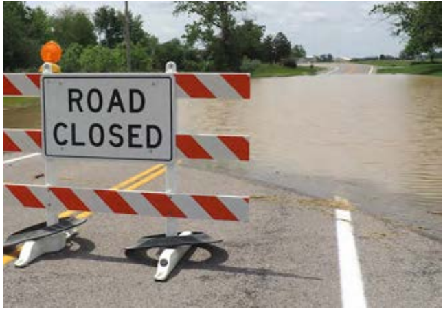
A common site after the week and a half of rains!

The Villages of Oakwood and Melrose in Paulding County, Ohio suffered more Flash Flooding Sunday evening, following isolated heavy rains the produced over 4 inches of rain in a short period of time. St. Roads 66 and 613 were both closed for a period of time due to the high water. A number of country and township roads were or remain closed in and around these communities. There were businesses and residential homes impacted by the high water. Basements and some first floors had water in them.