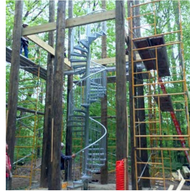
Central stairway has recently been installed and main platform is under construction at the high ropes course site