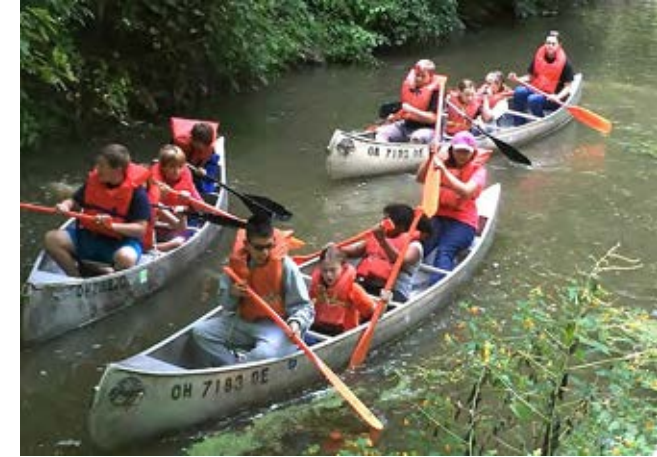
Canoeing at camp

The Camp Palmer staff and board are very thankful for a $12,000 grant from Bryan Area Foundations for the new high ropes project at camp. Other recent grants for this project have also included: $2500 grant from Defiance Area Foundation, $2500 grant from North Western Electric Trust Round Up and $500 grant from Midwest Electric Community Connection. 4-H Camp Palmer, Inc. serves youth from eleven counties in northwest Ohio and many groups from across the state, Michigan and Indiana. The new high ropes course scheduled for full completion by spring of 2018 replaces our original course that was built in 1990.