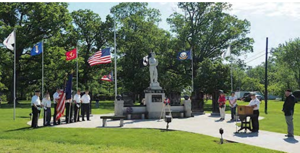
May 29 brought about the Memorial Day celebration for cities and towns across America to remember the past and present fallen heroes serving the country. The Antwerp VFW and American Legion stand at attention at the Veteran's Memorial in Riverside Park while the speakers came forward reminding us all of the sacrifices many men and women have made.