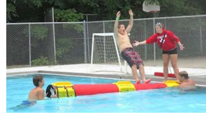
Fun in the pool