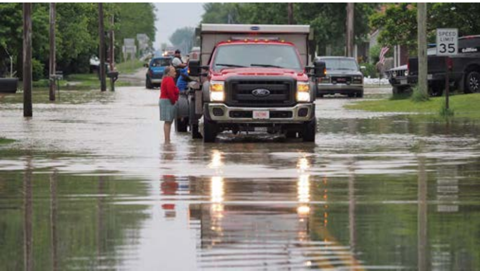
Flooding in Payne on State Road 49.

Starting around May 19 rain came pouring down from the heavens. The fields were drenched and the ditches and creeks began to fill. So much so that the rivers couldn't move the volume of water fast enough to accommodate all the rain that continued to fall. Areas around Payne to Paulding along the Flatrock Creek flooded when