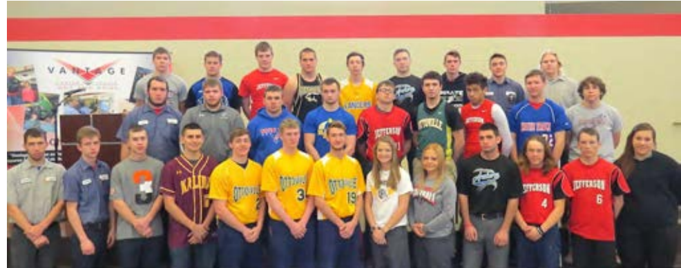
Over 30 Vantage students who participate in a spring sport at their home school were recognized recently on Spring Sports Spirit Day. Wishing all student athletes good luck and a great season!