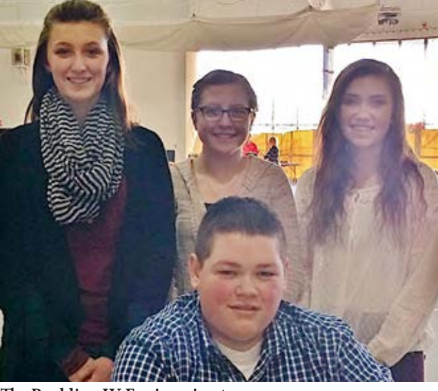
The Paulding JV Engineering team.

The Paulding Engineering Teams competed at the TEAMS competition held at Ohio Northern University. Over 40 teams from western Ohio participated.