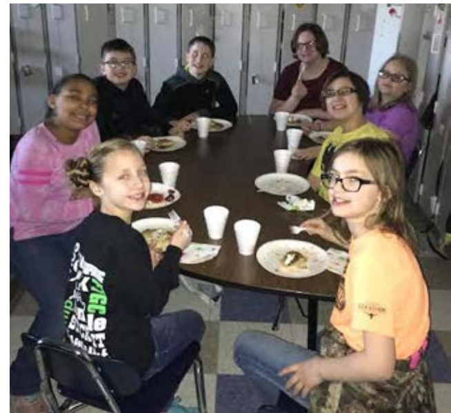
Paulding Elementary fourth graders who earned the third quarter incentive for great behavior and following directions earned a movie of Cloudy With A Chance Of Meatballs and a pancake bar!! Shown are two groups of fourth graders as they enjoy the pancake bar and meatballs!!