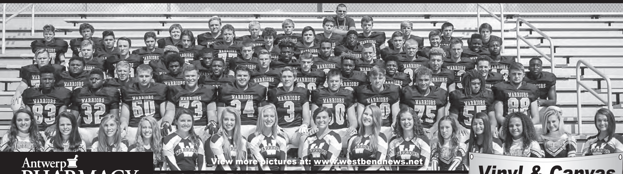
View more pictures at: www.westbendnews.net