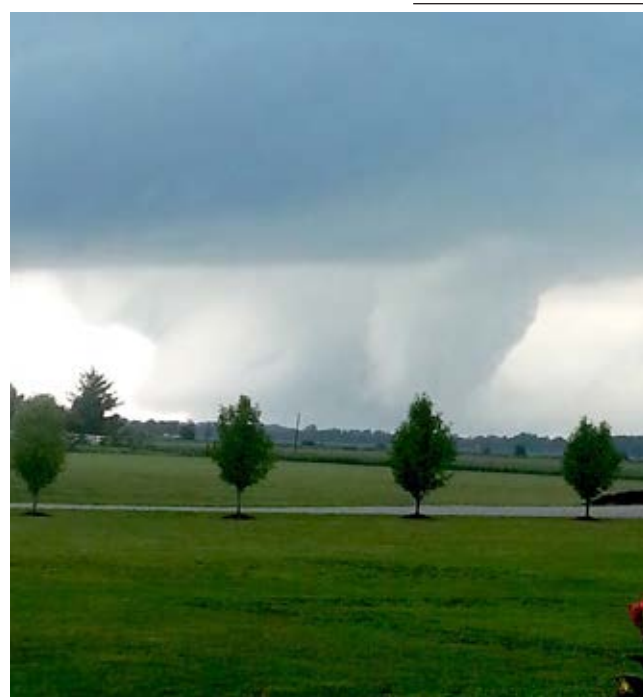
Looking towards Woodburn from Antwerp area.

Fortunately, the storm would shift in a northeasterly direction, impacting homes several miles north of town. The town was spared, but, unfortunately, many homes were not. The storm continued to cycle through its development stages and dropped another tornado to the north of Defiance and later Napoleon, where the Na-