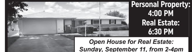
Personal Property: 4:00 PM Real Estate: 6:30 PM

Open House for Real Estate: Sunday, September 11, from 2-4pm