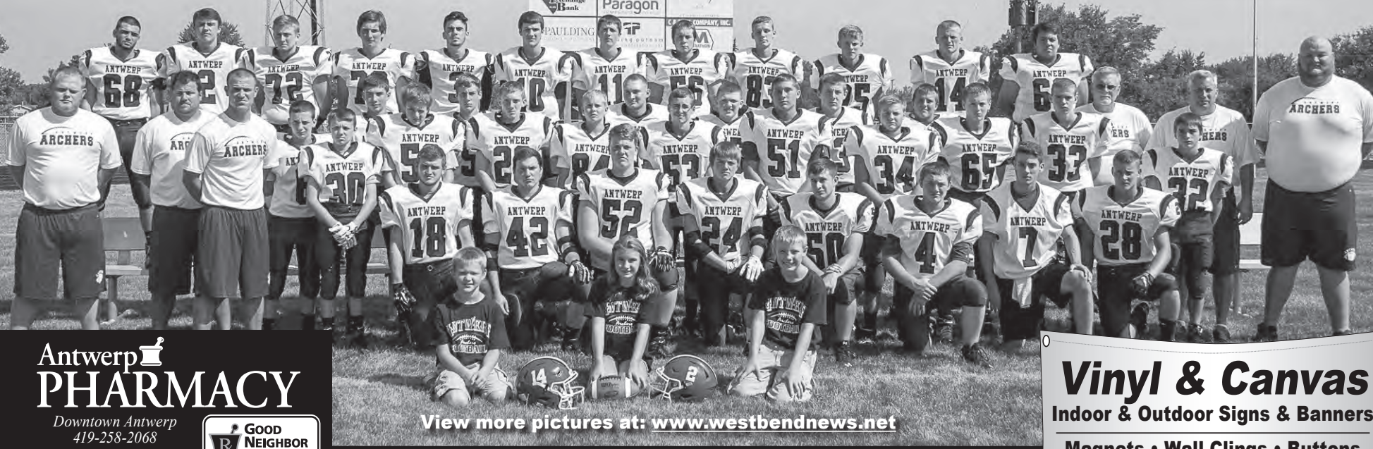
View more pictures at: www.westbendnews.net