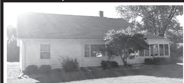
OPEN HOUSE: Sun., September 11, 2-4 pm