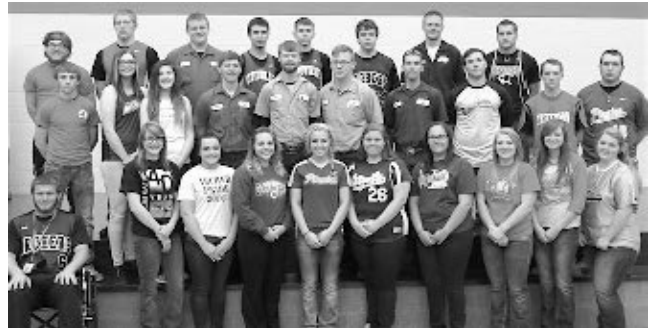
Many athletes were on hand when Vantage celebrated Spring Sports Spirit Day!

We can do your wedding, graduation, anniversary or any other announcement that you may need! Come in and browse our selection!! West Bend Printing & Publishing - 419-258-2000