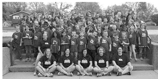
New Haven Primary students and staff participated in Mighty Milers this school year. They had 362 students participate in the program and 10 staff members also walked/ran. During recess, students had the opportunity to walk/ran laps on the playground. Those laps translated into miles. As a collective school, for the entire year, they have moved 7,162 miles! Pictured are students and staff that earn the T-shirt reward for their top mileage!