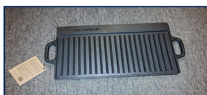
$25 / 2 BURNER - CAMPFIRE REVERSIBLE GRIDDLE *ONE SIDE SMOOTH, OTHER SIDE RIDGED*

Now Located Inside Cornerstone Collectibles & Antiques At The Intersection Of State Route 15 & US 20 Just South Of Pioneer, Ohio. (1000 S. State Street, Pioneer, Ohio 43554)