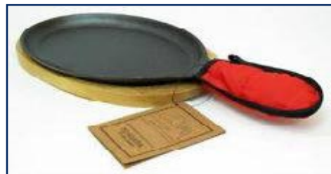
$16 SINGLE FAJITA PAN $28 / SET OF 2 FAJITA PANS ($14 EACH) $36 / SET OF 3 FAJITA PANS ($12 EACH) $40 / SET OF 4 FAJITA PANS ($10 EACH) *INCLUDES WOOD BASE & MITT*