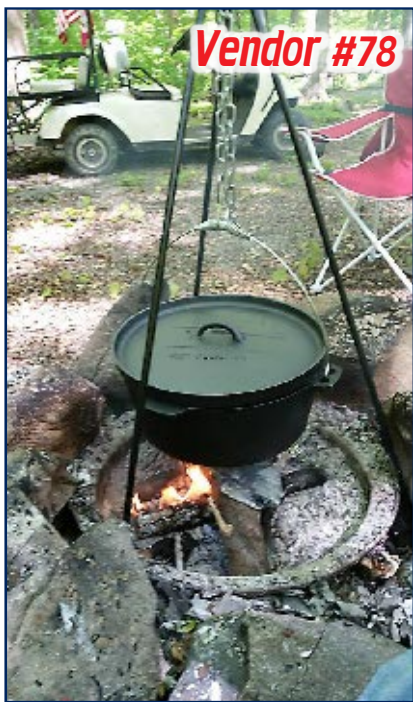
Vendor #78 $65 / 8 QUART DUTCH OVEN ($80 WITH TRIPOD) $95 / 12 QUART DUTCH OVEN ($110 WITH TRIPOD) $20 TRIPOD ALONE