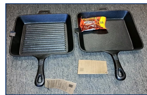
$21 SINGLE PAN $36 / SET OF 2 *RIDGED PAN FOR MEAT* **SMOOTH PAN FOR PANCAKES, ETC** ***ITEM IN PAN THE SIZE OF A HAMBURGER***