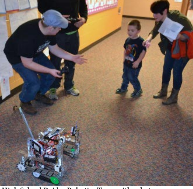
High School Raider Robotics Team with robot

STEAM Night. STEAM projects are an excellent hands-on learning experience for students to develop critical thinking skills.