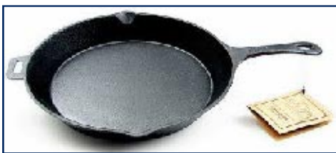
12 INCH SKILLET ($20) 15 INCH SKILLET ($35) 12 & 15 INCH SKILLET COMBO ($50)

Skillets ~ Dutch Ovens ~ Tripods ~ Griddles